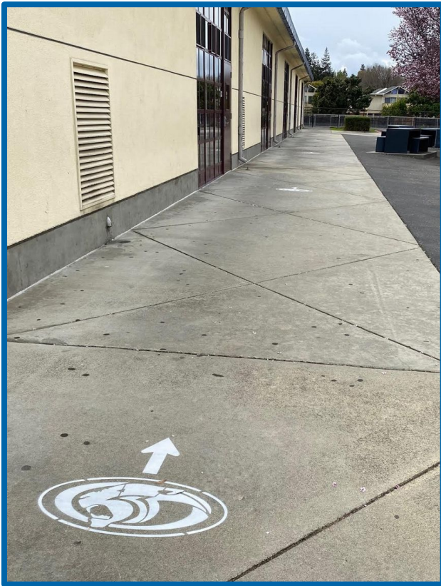
Mountain View Whisman School District